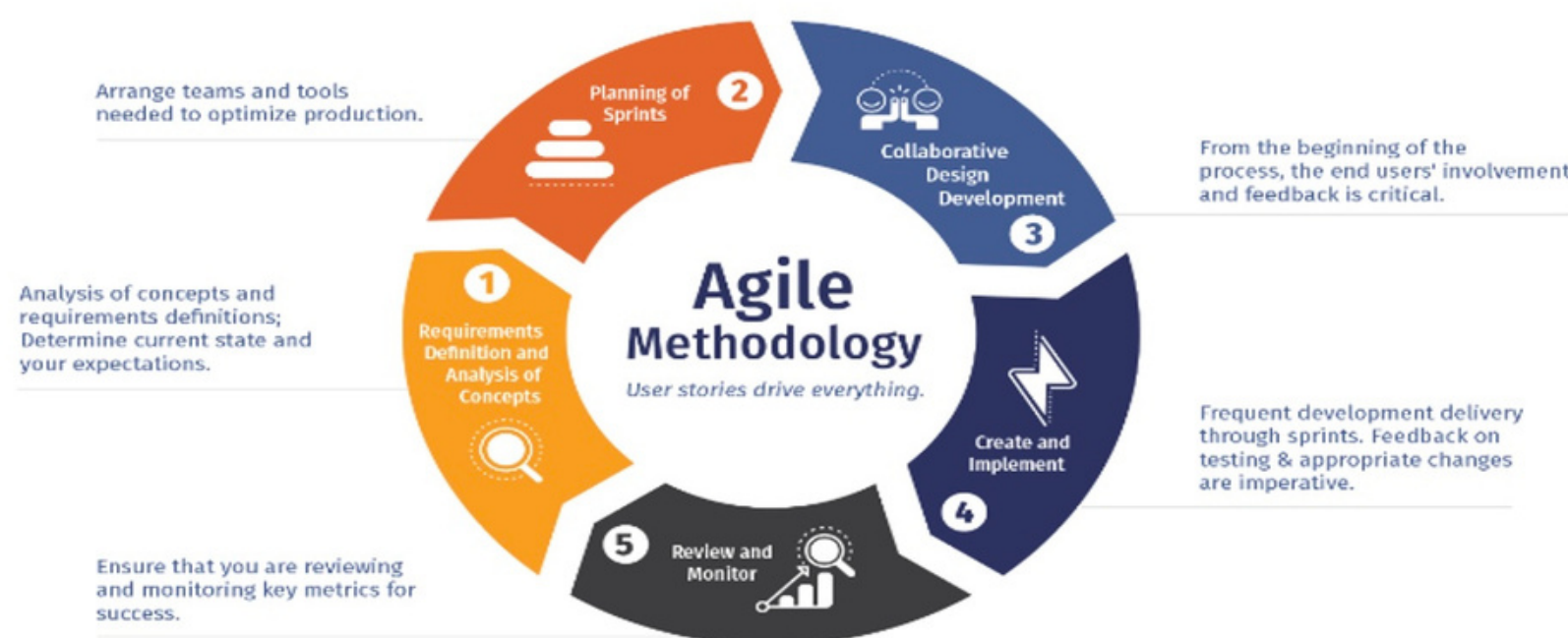
Figure 1: Project Methodology