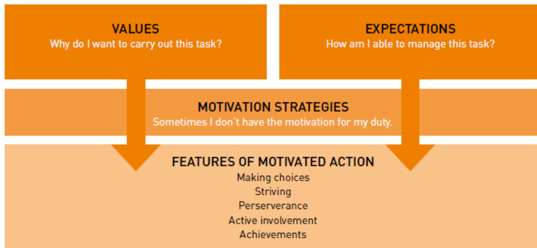
Figure 3: The structure of motivated action

Motivated students are persistent and committed to the issue they are learning, which promotes learning.